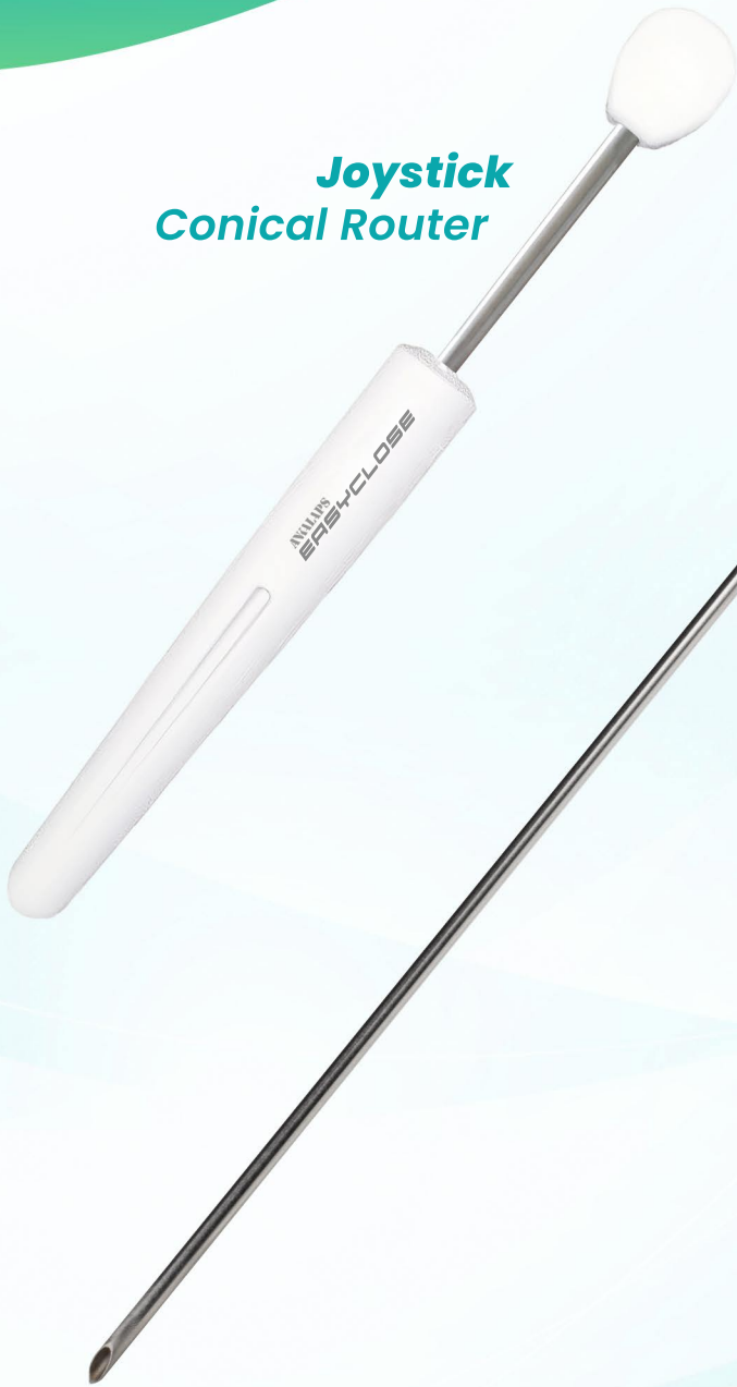
Joystick Conical Router