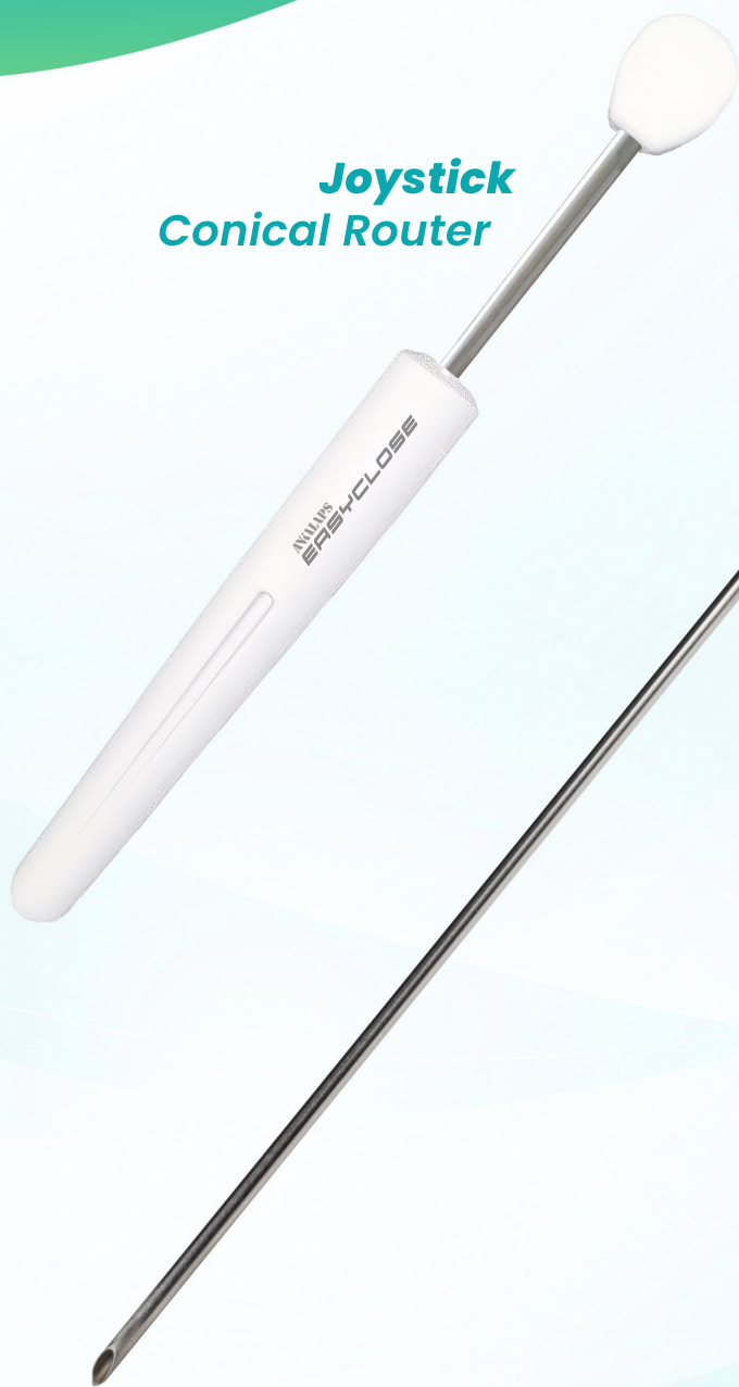
Joystick Conical Router